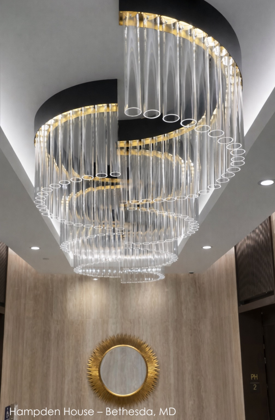
Hampden House – Bethesda, MD