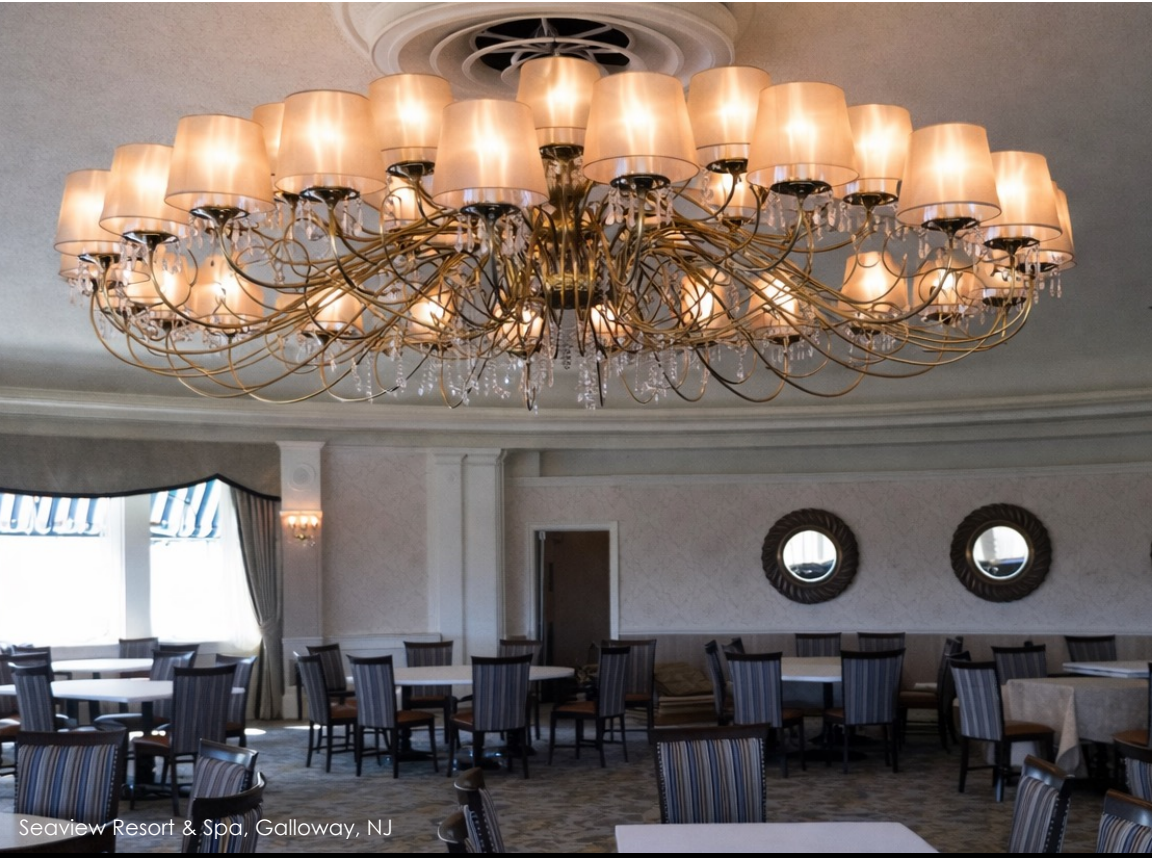
Seaview Resort & Spa, Galloway, NJ