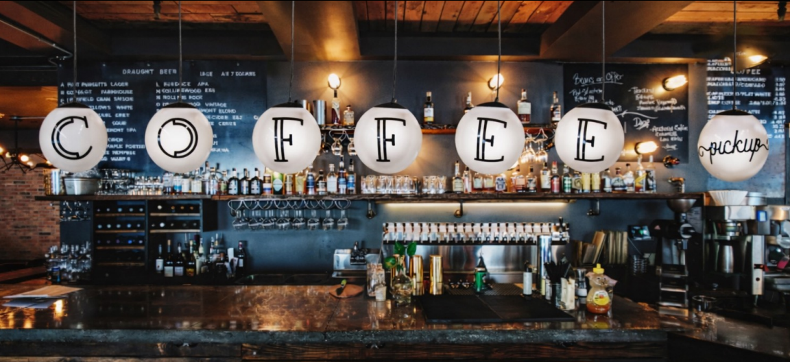
Coffee Shop - Patterson, NJ