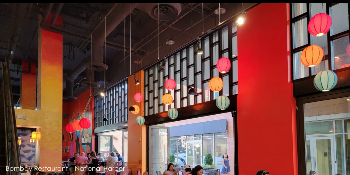
Bombay Restaurant - National Harbor