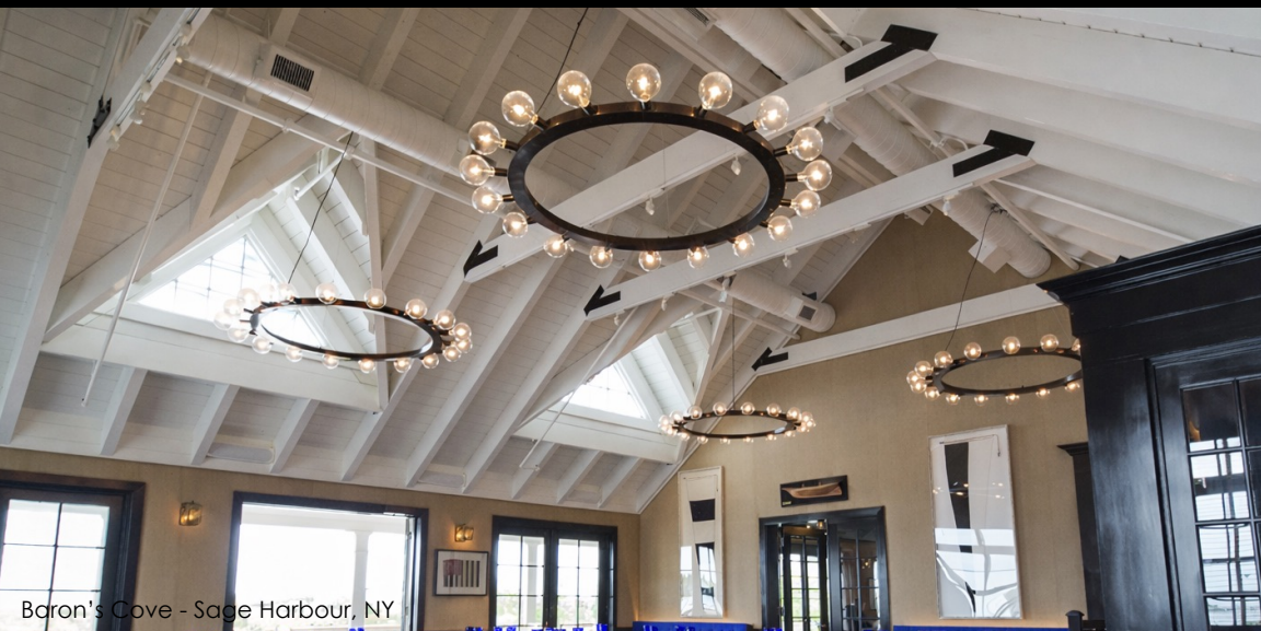
Baron's Cove - Sage Harbour, NY