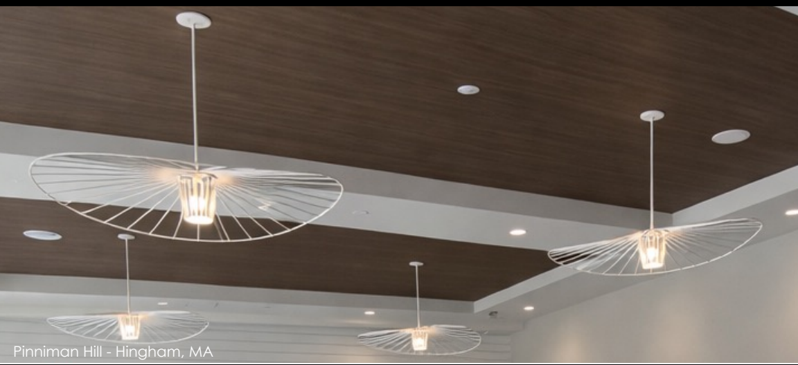
Pinniman Hill - Hingham, MA