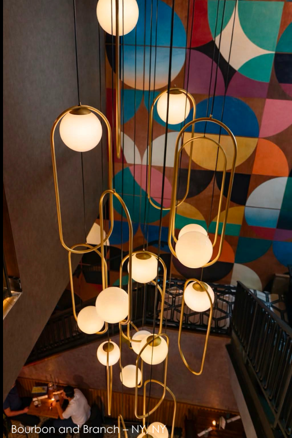
Bourbon and Branch – NY, NY