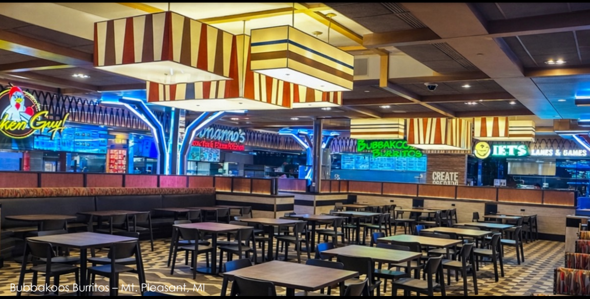
BubbaKoo's Burritos - Mt. Pleasant, MI