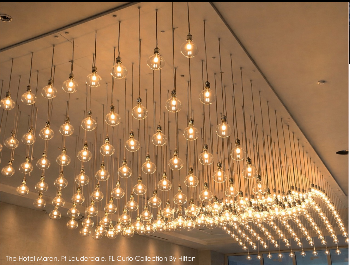
The Hotel Maren, Ft Lauderdale, FL Curio Collection By Hilton