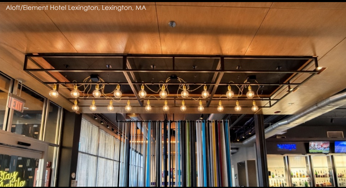
Aloft/Element Hotel Lexington, Lexington, MA