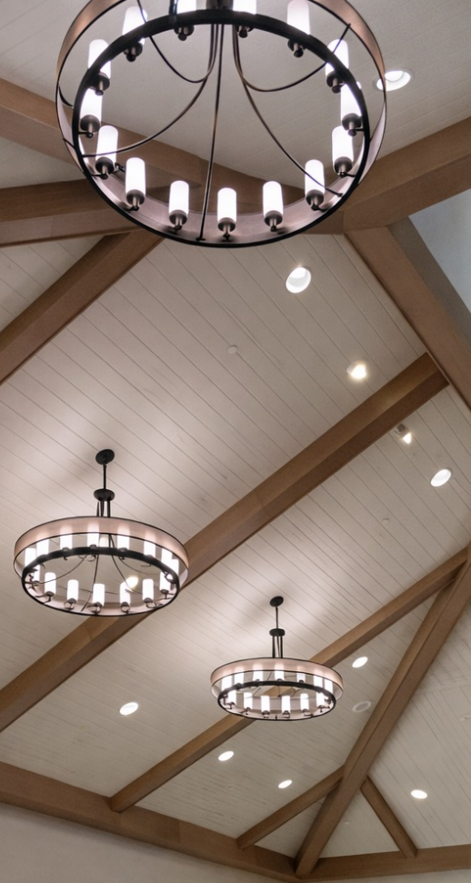
Bennie G. Adkins Veterans Home – Enterprise, AL