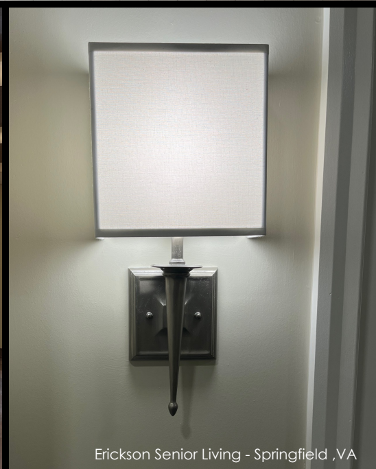
Erickson Senior Living - Springfield ,VA