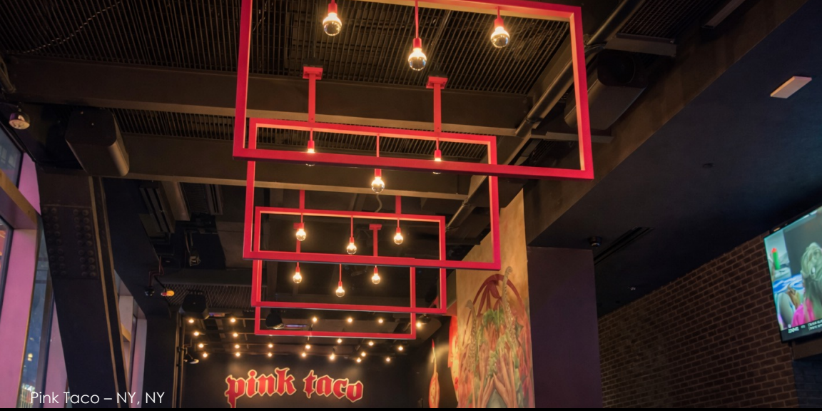
Pink Taco – NY, NY