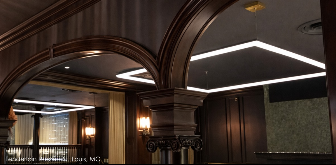
Tenderloin Room - St. Louis, MO