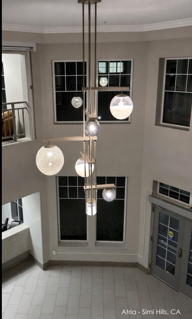
Atria - Simi Hills, CA