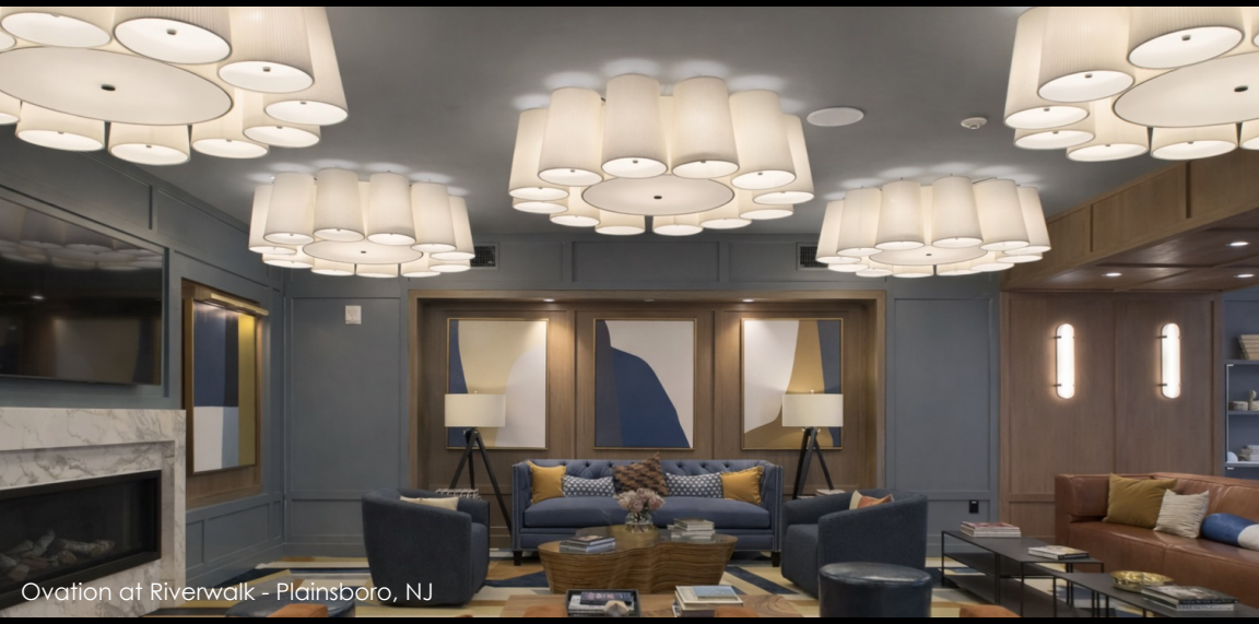
Ovation at Riverwalk - Plainsboro, NJ