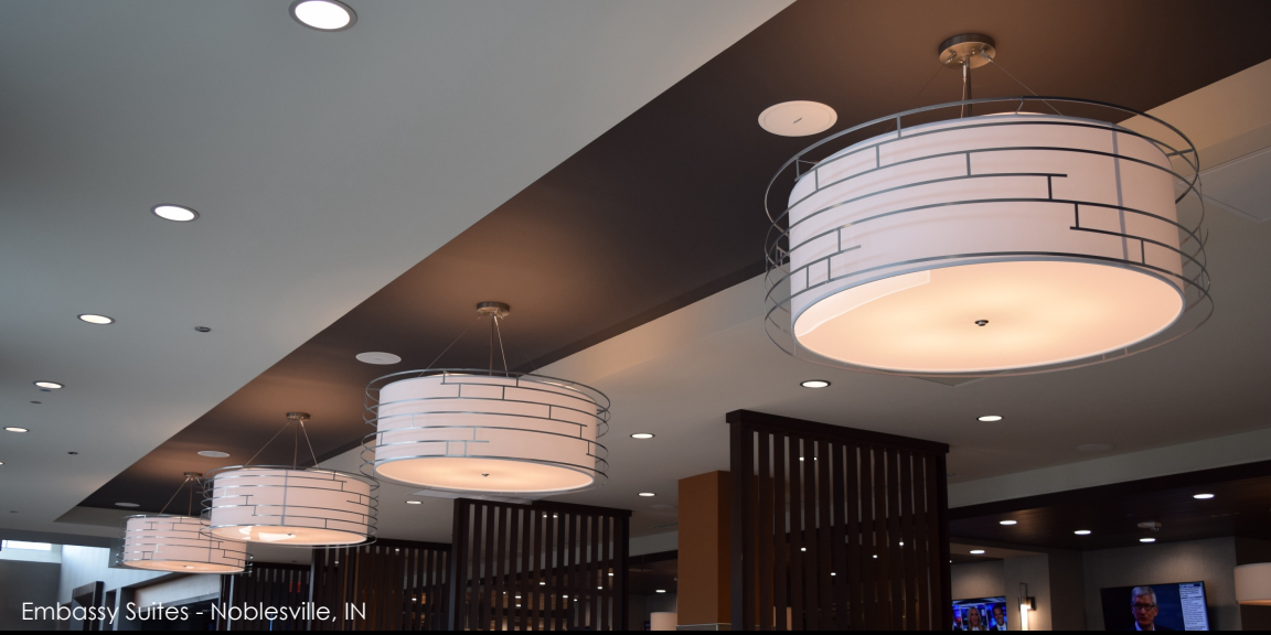
Embassy Suites - Noblesville, IN