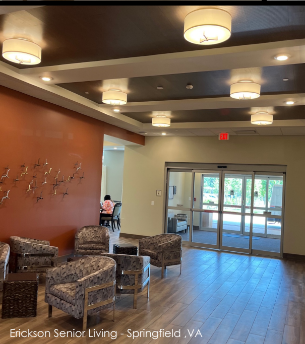
Erickson Senior Living - Springfield ,VA