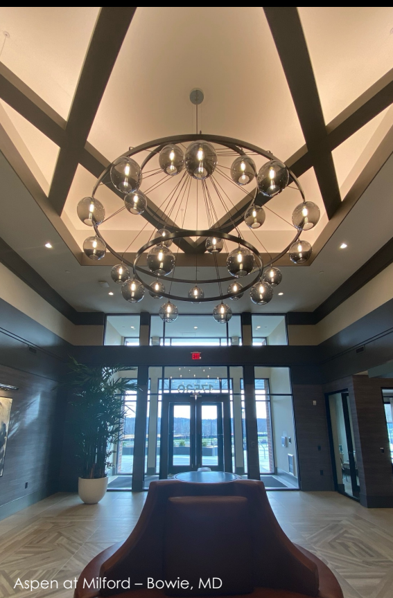
Aspen at Milford – Bowie, MD