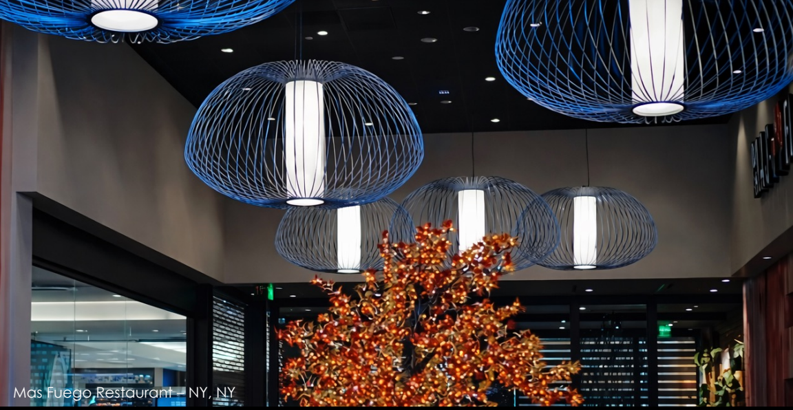
Mas Fuego Restaurant - NY, NY