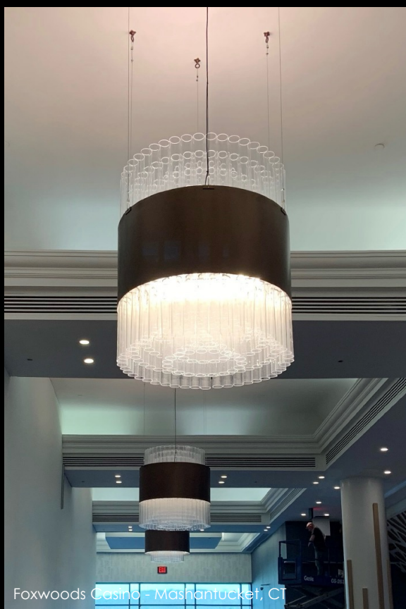
Foxwoods Casino – Mashantucket, CT