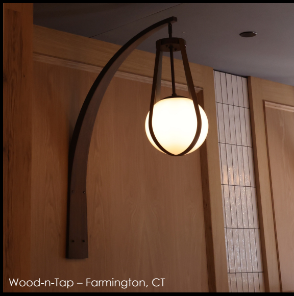
Wood-n-Tap - Farmington, CT