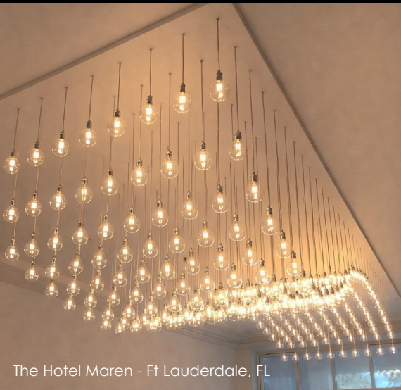
The Hotel Maren - Ft Lauderdale, FL