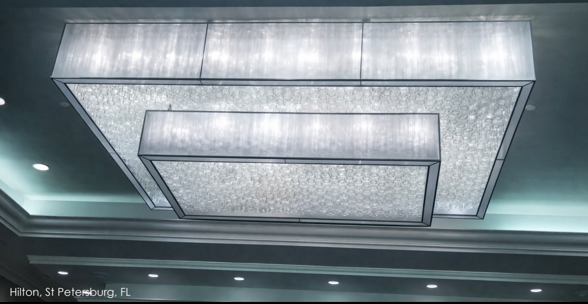
Hilton, St Petersburg, FL