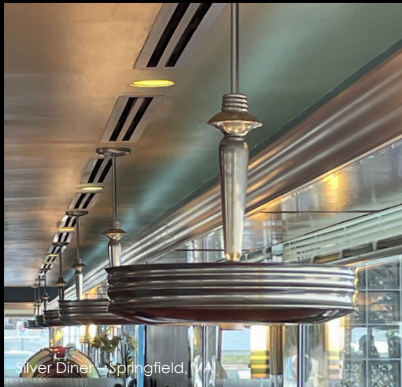
Silver Diner - Springfield, MA