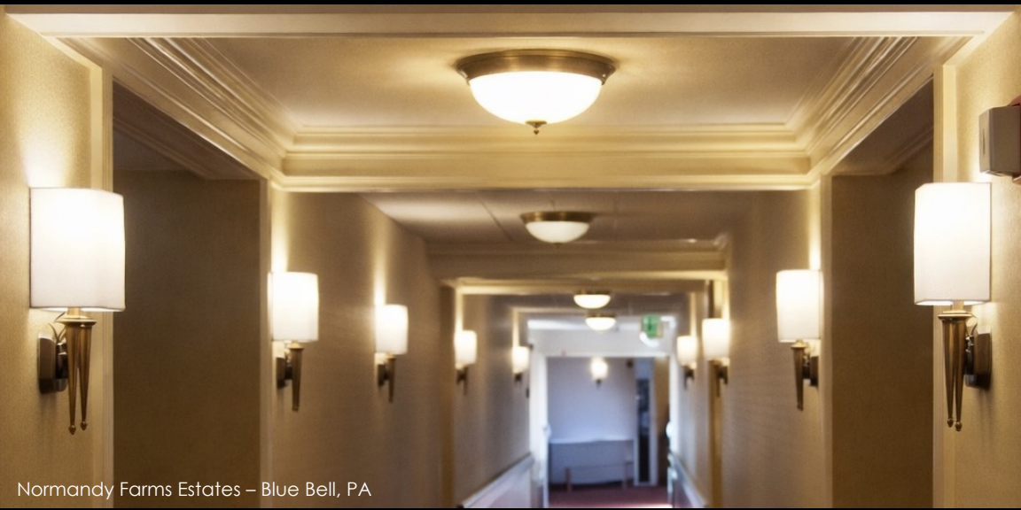
Normandy Farms Estates – Blue Bell, PA