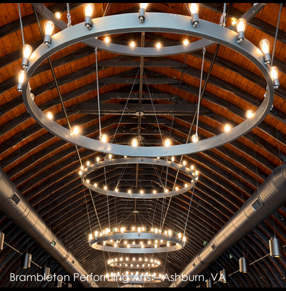
Brambleton Performing Arts - Ashburn, VA