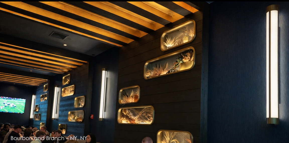
Bourbon and Branch – NY, NY