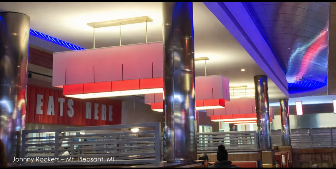
Johnny Rockets – Mt. Pleasant, MI