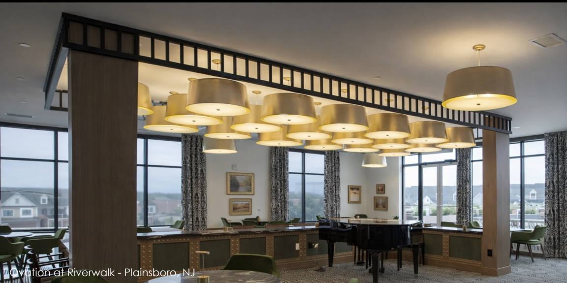
Ovation at Riverwalk - Plainsboro, NJ