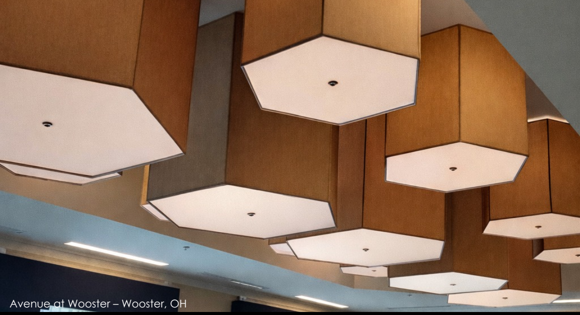
Avenue at Wooster – Wooster, OH