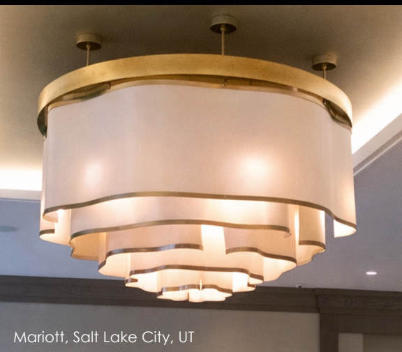
Mariott, Salt Lake City, UT